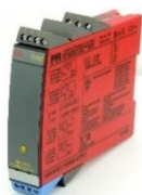
Isolator Used with AMT-Ex and DS4000 in the Safe area