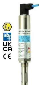
AMT-Ex For Hazardous Applications

The Dewpoint Transmitters and Isolator below are fully compatible with the DS4000 Dewpoint Hygrometer: