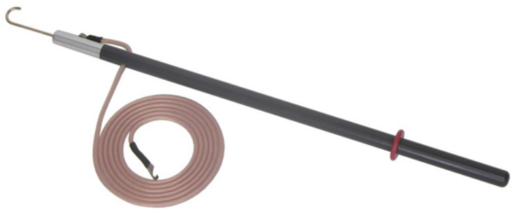
ES30 Earthing stick

If you require a different output voltage test system please contact us with your specification and we will quote for a custom design.