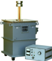
KV100-100 100kV 100mA

High voltage test systems are also available from T&R Test Equipment up to 100kV 100mA.